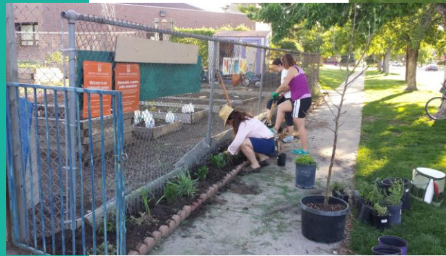
Work Days at the Community Garden