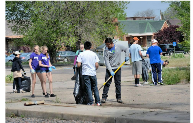
Neighborhood Clean Up Days